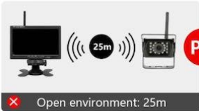
Open environment: 25m