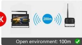
Open environment: 100m